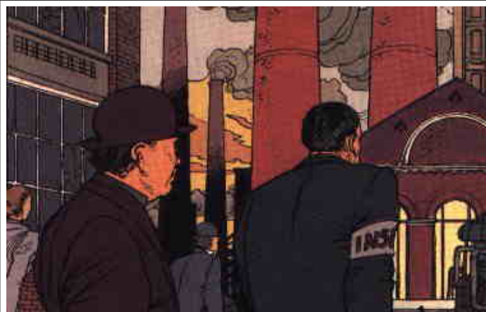
The bowler: power and influence in Mylos